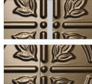
Bead + Button